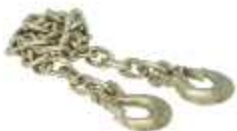
5TH WHEEL TO GOOSENECK SAFETY CHAINS