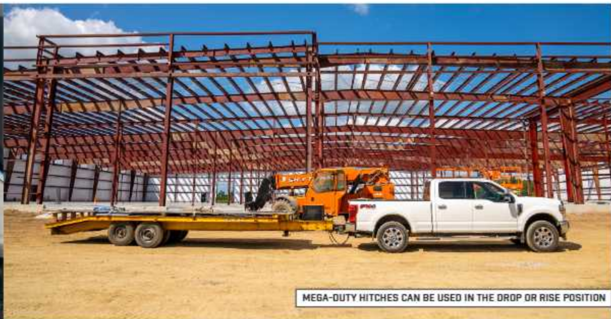
MEGA-DUTY HITCHES CAN BE USED IN THE DROP OR RISE POSITION

SHANK 2" TOWING 16,000 LBS. TONGUE WEIGHT 2,000 LBS.