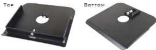
EXECUTIVE KING PIN CAPTURE PLATE