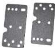
EXECUTIVE SHIM PLATES