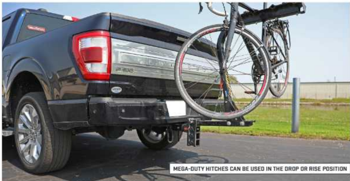
MEGA-DUTY HITCHES CAN BE USED IN THE DROP OR RISE POSITION

OFFSET SHANK 2" TOWING 10,000 LBS. TONGUE WEIGHT 1,500 LBS.