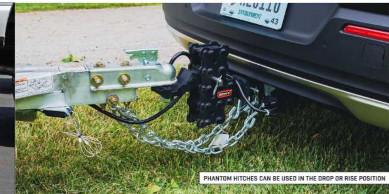
PHANTOM HITCHES CAN BE USED IN THE DROP OR RISE POSITION

SHANK 2" TOWING 5,000 LBS. TONGUE WEIGHT 500 LBS.