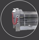
Drop Down Sides