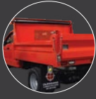
Powder Coating Color Options