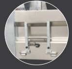
Fold-Up 2 Step Ladder