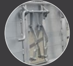
Champion Hoist Installed