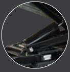
Champion Hoists Manufactured in USA